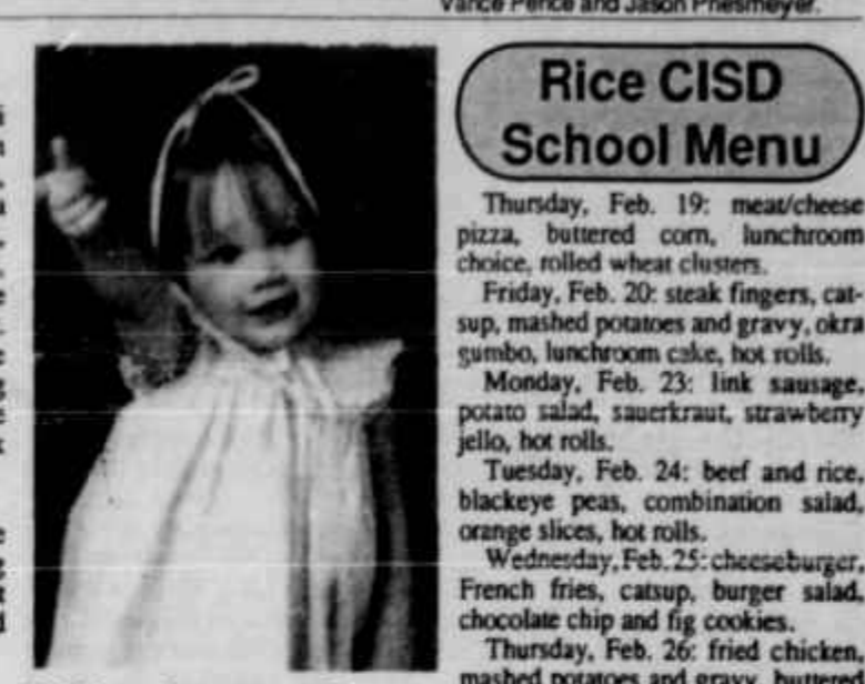
Who's zat? "What a cute baby!" Many people said that when they saw the picture of this week's "Who's Zat" baby.